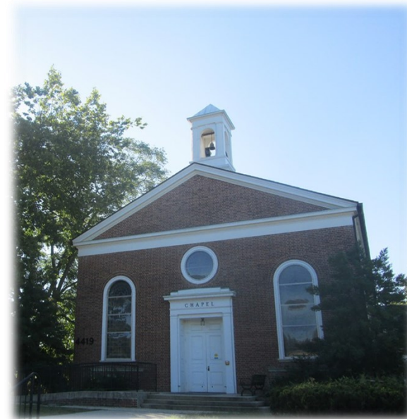
Main Post Chapel

Religious Support Office 4419 Llewellyn & Roberts Avenue Fort Meade, MD 20755-5065 (301) 677-6703